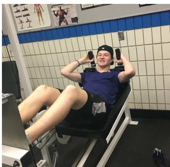
Health and Wellness Sector Nutrition and Human Performance

Students At work in the SHSM's Here at SRB - (Do you guys have a picture of your students at Work)